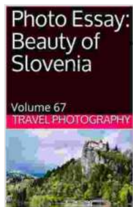
Photo Essay: Beauty of Slovenia: Volume 67 (Travel Photo Essays) by Eckhard Toboll