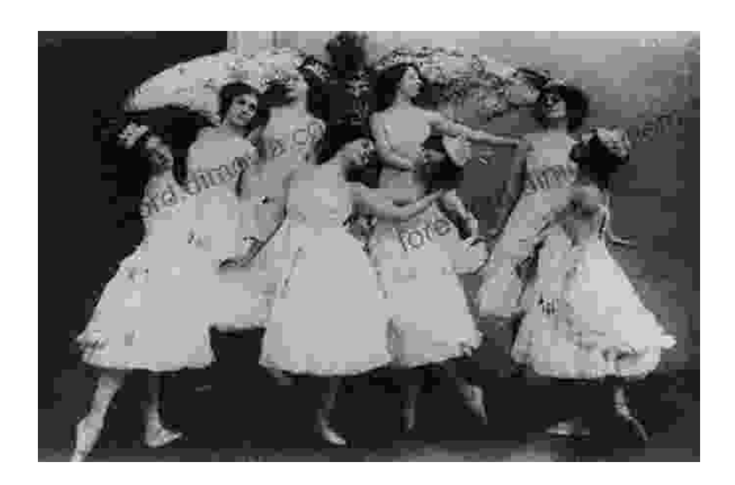
Chapter 2: The Emergence of Aesthetic and Expressive Dance

Our exploration begins in the early 19th century, when dance found its footing in Boston's cultural landscape. European immigrants brought with them their own traditions and influences, which gradually blended with local customs to create a unique and eclectic dance scene. Dance halls and theaters sprang up, providing a platform for aspiring dancers and eager audiences. The city's first ballet company, the Boston Ballet, was founded in 1963, solidifying Boston's position as a hub for dance.