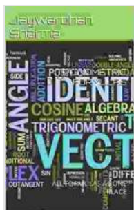
Image Alt: Book cover of Trigonometric Formulas All Formulas At One Place, featuring a vibrant graphic representation of trigonometric functions.