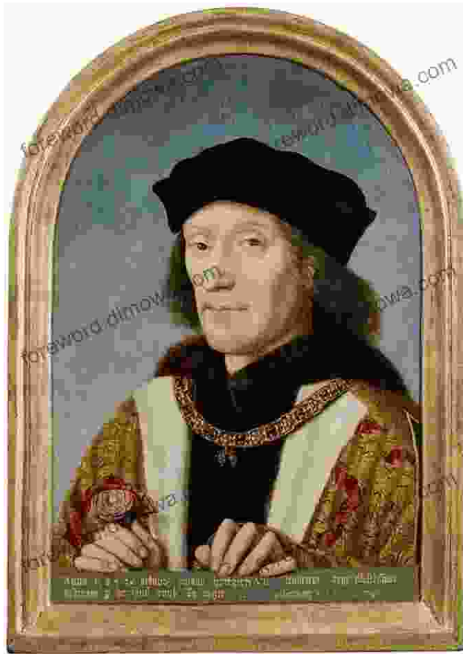
Collection of royal portraits from various eras