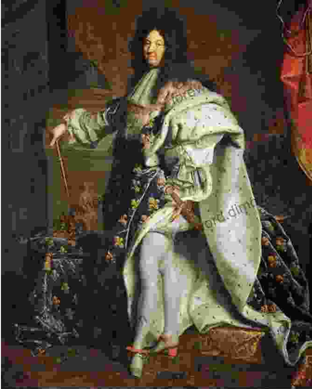
Louis XIV, painted by Hyacinthe Rigaud, 1701

Beyond their aesthetic appeal, royal portraits offer a rich tapestry of symbolism and regalia. Every detail, from the intricate embroidery on robes to the choice of background, carries a coded message, conveying the power and legitimacy of the monarch. These portraits were not mere artistic