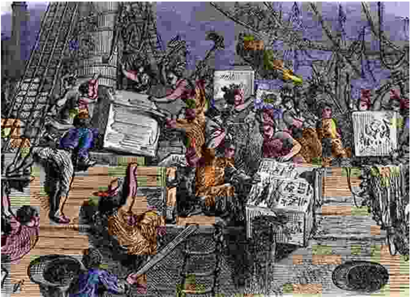
The Boston Tea Party site, a symbol of American defiance and the pursuit of liberty

Across the Atlantic, we embark on the second chapter of our adventure in the bustling city of Boston, Massachusetts. Here, on the shores of the Charles River, the seeds of American independence were sown. We'll visit the site of the infamous Boston Tea Party, where a group of courageous colonists disguised as Mohawk Indians boarded three British ships and dumped their cargo of tea into the harbor, sparking a chain of events that would culminate in the American Revolution.