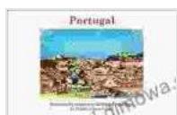
Portugal: Portrait of a Country in 32 Digital Paintings (VG Art Series) by Vladimir Geroimenko

Whether you're looking for a gift for a special occasion or simply want to indulge in the beauty of the countryside, this book is sure to captivate and inspire. Free Download your copy today and embark on a visual journey that will leave a lasting impression.