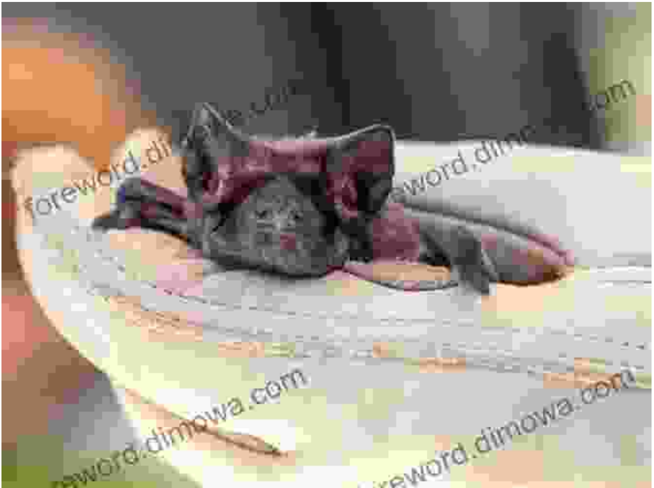
Florida Bonneted Bat ( Eumops floridanus )

In "Encounters With Florida Endangered Wildlife," Doe exposes the alarming reality facing many species. The Florida bonneted bat, with its dwindling population, is an example of the fragility of these creatures. The book also highlights the efforts of dedicated conservationists and organizations working tirelessly to protect endangered wildlife.