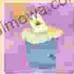
4. Place soiled diaper in a non-leak-proof bag and seal in a plastic bag.