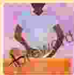
3. Keep one hand in contact at all times.