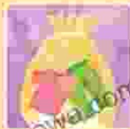
8. Seal soiled diaper in a plastic bag.