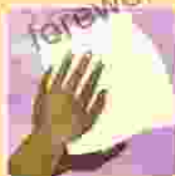
11. Dry hands.