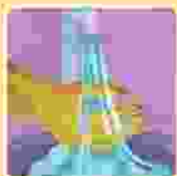
10. Wash your hands.