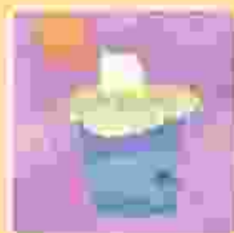
12. Place soiled diaper in a non-leak-proof bag and seal in a plastic bag.