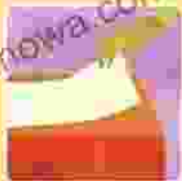
2. Preline the surface with toilet paper or disposable paper.