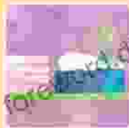
1. Get supplies ready.