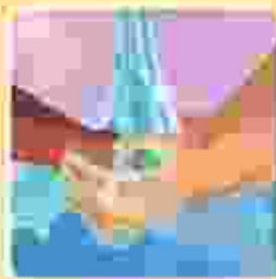
7. Wash your hands and the child's buttocks and back in the great.