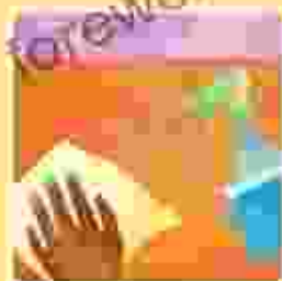
9. Remove disposable paper from clean and soiled.