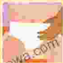
6. Diaper and flush the toilet.