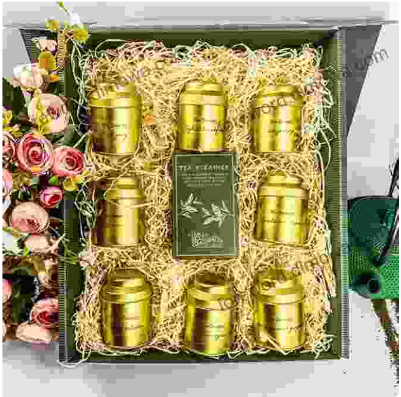
A selection of Hitta Tea Maker products